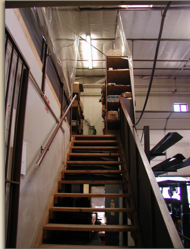
Stair to Loft

COMMERCIAL PROPERTIES, INC (505) 216-1500