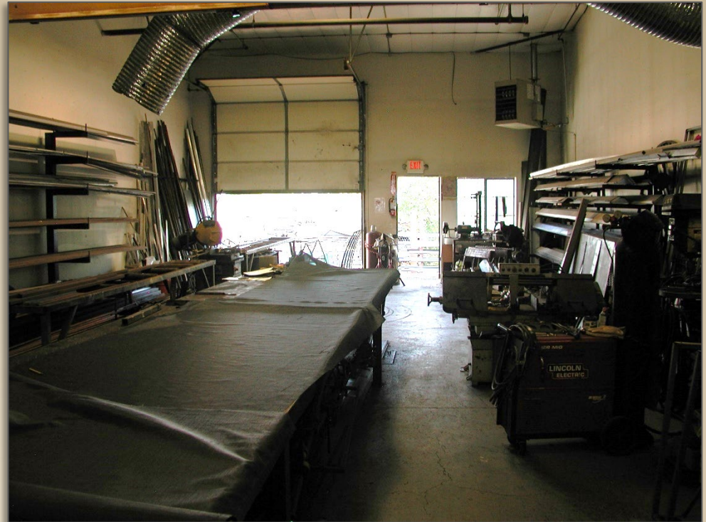
Open Work areas