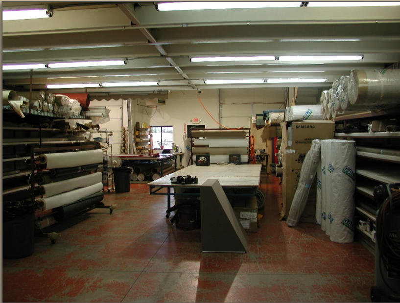
Ground floor Work Area