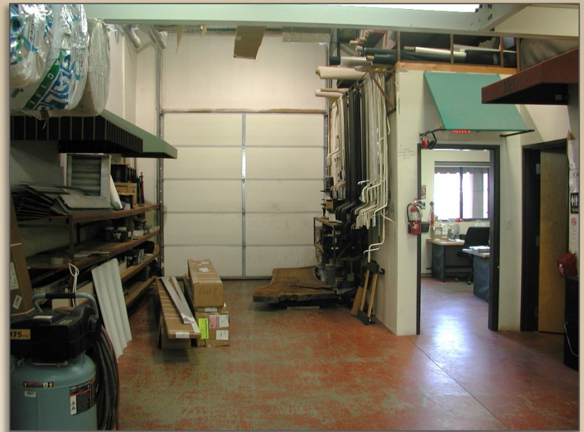
Garage door and Office

COMMERCIAL PROPERTIES, INC (505) 216-1500