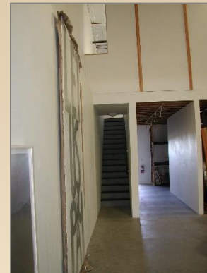
Stairs to Loft